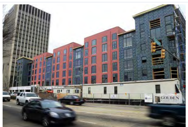
The $35 million Cityville Block 121 is starting to resemble the final version of the massive project as envisioned by developers and architects.

The $35 million Cityville Block 121 project has rapidly risen in the city block between 20th Street and Richard Arrington Jr. Boulevard and First and Second Avenues South in Birmingham.