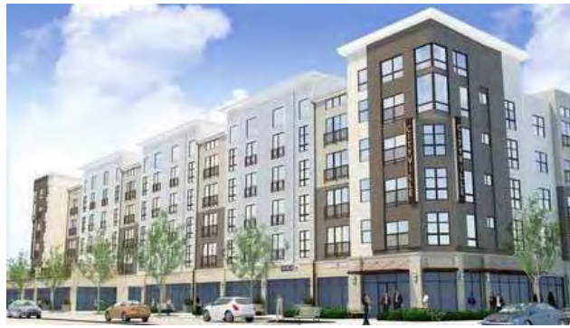
Rendering shows anticipated appearance of project at completion. (Special)